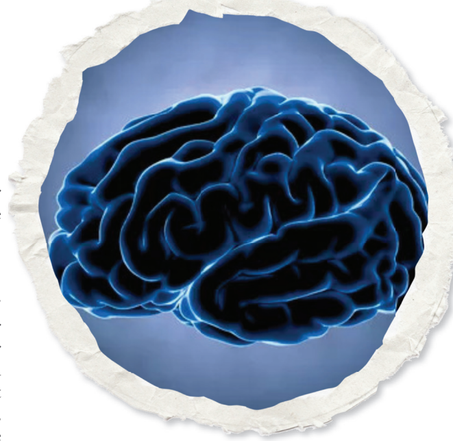
The Muslim Theist

One of the most important recurring themes in the Quran is that of awakening the heart. It talks in depth about “intellecting” with the heart. To intellect basically means to direct one’s consciousness through a particular modality such that you discover or realize truth. We are familiar with this process when it comes to rational thought (another modality of consciousness), but it seems alien when it comes to the heart. Just think of it like “thinking” with your heart